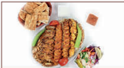
CHICKEN SPECIAL PLATTER

Lamb Shish (1 skewer), Adana (1 skewer), Koubideh (2 skewers), Lamb Shawarma (complimentary)