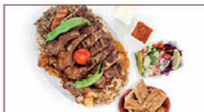
WAZIR'S SPECIAL PLATTER

1 Chicken Beyti, 1 Chicken shish, 1 Lamb Shawarma, 1 Chicken Shawarma, 1 Lamb shish, 1 Koubideh Kebab, 7pcs chicken wings, 1 Adana Kebab