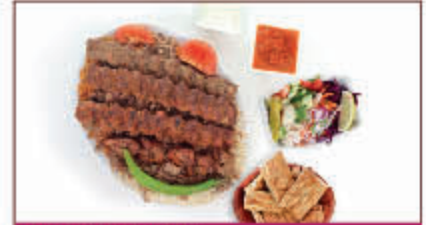
LAMB SPECIAL PLATTER

This platter is served with Basmati Rice