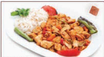
CHICKEN OR MEAT TAWA

Combination of chicken shish & chicken beyti.