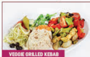
VEGGIE GRILLED KEBAB