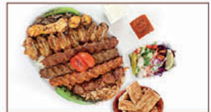
WAZIR'S JUMBO PLATTER

For 3-4 people to share | The dish contains mince meat & mixed doner Lamb Shawarma, Chicken Shawarma, 2 Kofte, 2 Adana, 2 Beyti