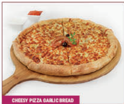
CHEESY PIZZA GARLIC BREAD