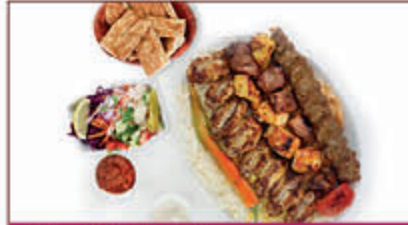
PERSIAN COMBO PLATTER