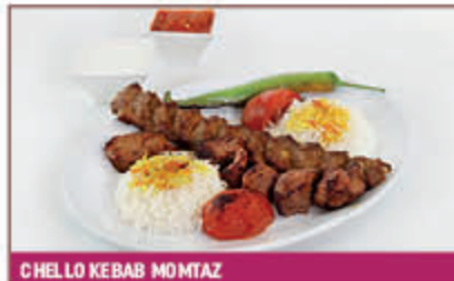
CHELLO KEBAB MOMTAZ

Two skewers of minced baby lamb served with grilled tomato