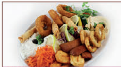
MIXED MEZZE PLATTER

Very thin traditional Turkish Pizza covered with the seasoned minced lamb & onion, fresh tomatoes, parsley & red pepper.