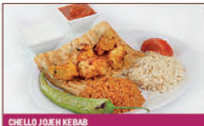
CHELLO JOJEH KEBAB

One skewer of minced baby lamb & one skewer chicken fillet cubes served with grilled tomato