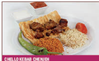
CHELLO KEBAB CHENJEH

One skewer chicken fillet cubes marinated in a special sauce and spices grilled on skewer