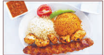
SPECIAL CHICKEN BEYTI

Specially prepared lamb or chicken mince with herbs on skewers char-grilled, wrapped in a thin homemade bread topped with homemade tomato sauce.