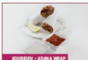
KOUBIDEH - ADANA WRAP