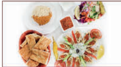
LAMB OR CHICKEN SARMA PLATTER

Chicken or lamb doner slices over toasted homemade bread topped with special tomato sauce, yogurt and drizzled with butter.