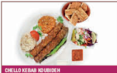
CHELLO KEBAB KOUBIDEH

All Persian dishes are served with salad, chilli & garlic sauces, bread & basmati rice