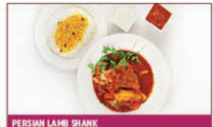
PERSIAN LAMB SHANK

One skewer of diced tender baby lamb fillet cubes served with grilled tomato