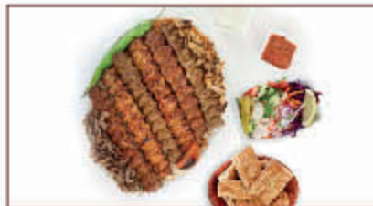
WAZIR'S KOFTA PLATTER

1 Chicken shish, 2 Chicken Beyti, 7pcs chicken wings & chicken shawarma (complimentary)