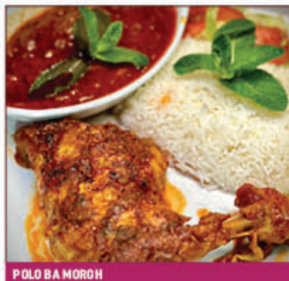
POLO BA MORGH

A portion of meat around the tibia of the baby lamb slowly cooked in a pot with tomato sauce & vegetables