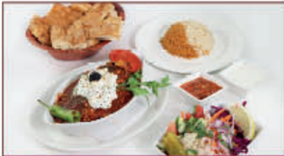
LAMB OR CHICKEN ISKENDER KEBAB

The following dishes are served with bread, house salad, garlic and chilli sauce. Rice/ couscous can be swapped for chips for 1.5