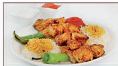
CHICKEN OR LAMB SHISH