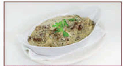
CREAMY GARLIC MUSHROOM

Onion rings, hummus, jajik, halloumi, calamari, borek, sujuk.