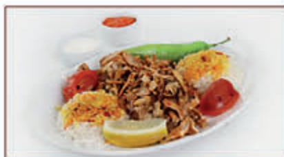
CHICKEN OR LAMB SHAWARMA

The following dishes are served with bread, house salad, garlic and chilli sauce. Rice/ couscous can be swapped for chips for 1.5