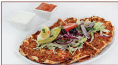
LAHMAJOUN OR LAHMAJOUN WRAP