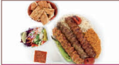
WAZIR'S SINGLE PLATTER

Please note- Any additional Skewers of Lamb ribs or Lamb chops will be an extra 11.99 Any other kebabs would be an extra 7.99 (No swaps allowed) (All Served with Hummus, Jajik, Rice, Couscous, Bowl of Salad, Bread, Garlic & Chilli Sauce)