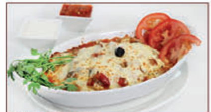
MEAT OR VEG LASAGNE

Aubergine onion, peppers, mushrooms are quickly cooked in a special pan for maximum nutritional value.